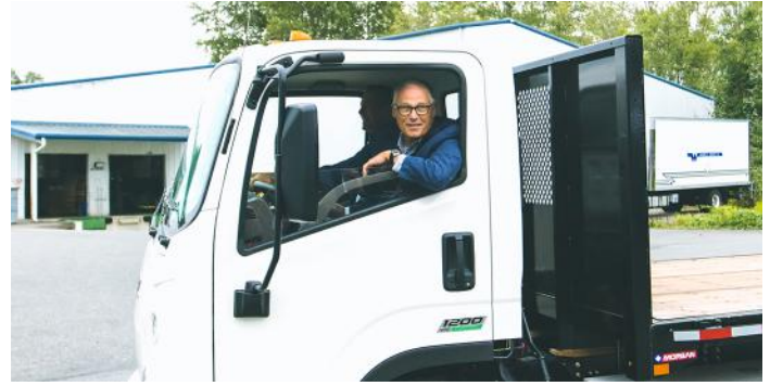
Gov. Jay Inslee takes a spin in Vicinity Motor's VMC 1200 truck.

Social and economic impacts are boosted by investment in the growing Indigenous tourism sector in the Pacific Northwest region. Through Expedia Group's partnership with Indigenous Tourism Association of Canada , Washington state and Canada benefit from our shared value to promote inclusive economies, and to support the sustainable economic development of underrepresented Indigenous communities in the tourism industry in the region.