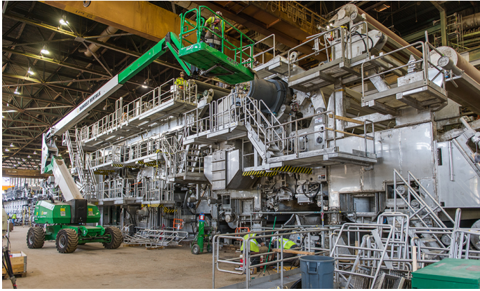
Bear Island facility.