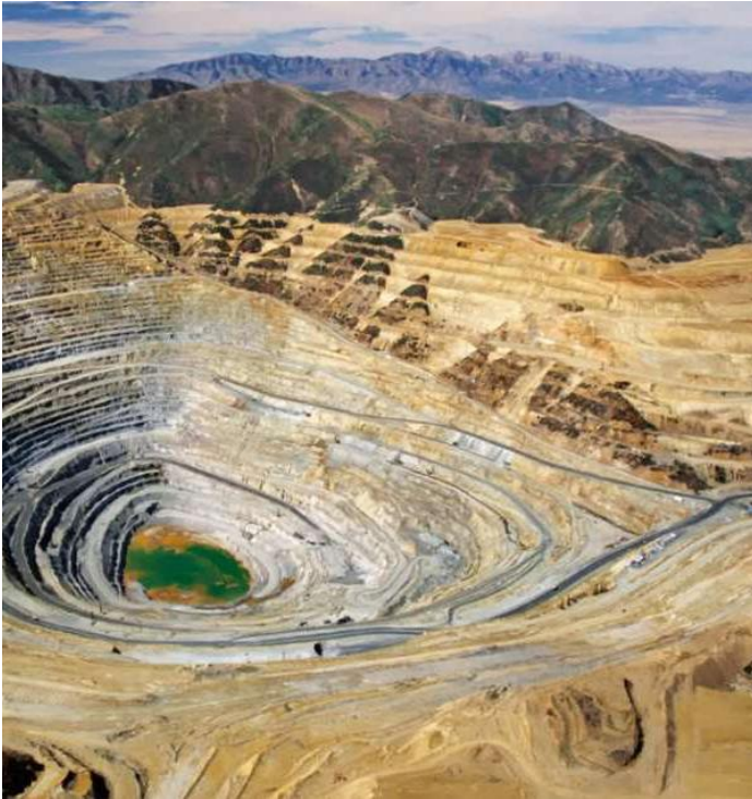
Rio Tinto's Kennecott mine.