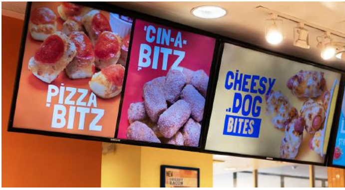
Wetzel's Pretzels signage.