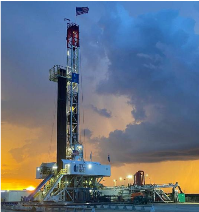
Permian Basin oil rig.