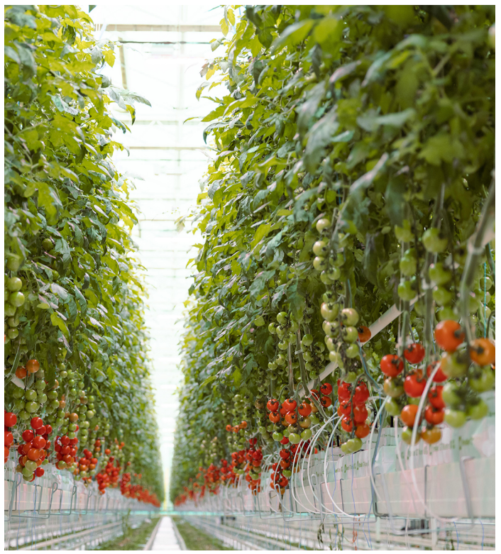
Tomato vines at AppHarvest Richmond.