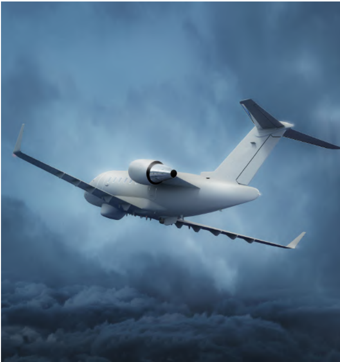
Bombardier Defense Challenger 650. Photo: Bombardier