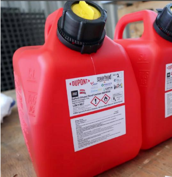
In response to the COVID-19 crisis, DuPont's Kingston, Ontario Technology Centre produced and donated hand sanitizer.